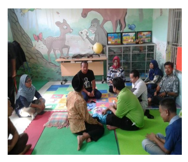
Figure 4. Massage Workshop for Blind People in Public Library of Kendal Regency (Public Library of Kendal Regency Report, 2019)

"...We also facilitate women according to their needs, to improve their family's economy. They asked for training on making craft from purr ropes. It had 20 people at first but then 33 people in total. We are in cooperation with Magic Hand community. The impact can already be seen, which can increase family's income... "