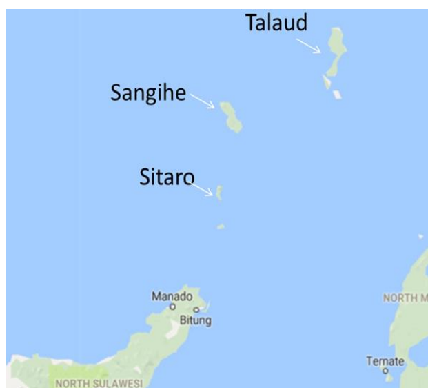
Figure 1. Region of Siau Tagulandang Biaro Island in North Sulawesi