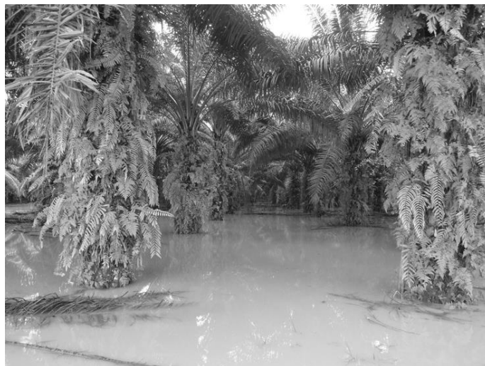
Figure 3. Flooding on an oil palm plantation in the Johor River Watershed, Malaysia (December 2012)