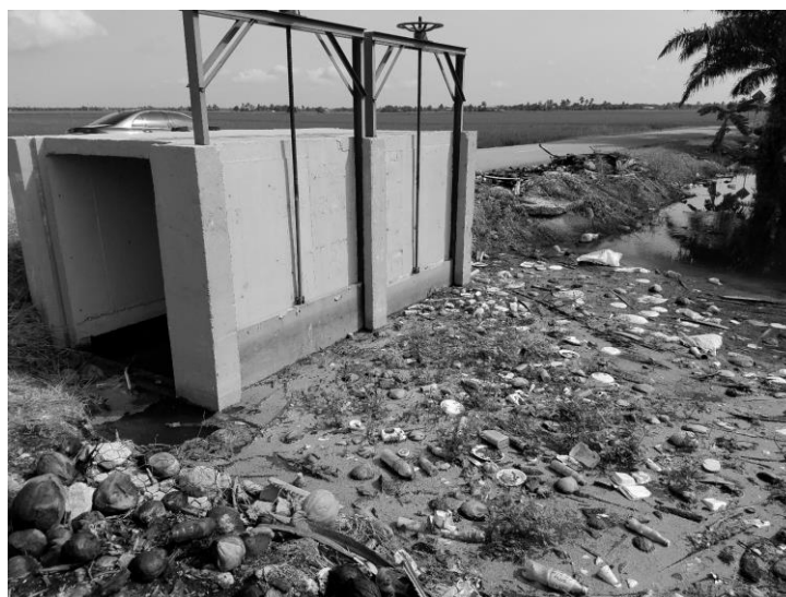
Figure 5. Garbage in the drain near the water gate connected to a paddy field (August 2016)