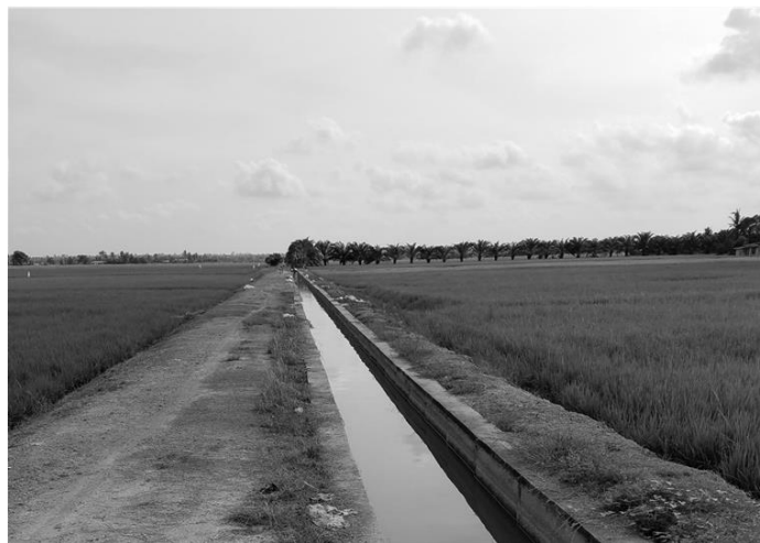
Figure 4. Drain in a paddy field in Tanjung Karang, Malaysia (August 2016)

During the field survey conducted near the Selangor River Watershed in August 2016, the days without rains were prolonged on account of the El Niño phenomenon, which limited the observed downstream flow of the paddy fields. Also, just outside the paddy fields, there was a significant amount of garbage at the mouth of the drain as shown in Figure 5. Trash returned to the top and it often clogged the water gate which, in turn, hindered the effective water management in the paddy fields as well as that of the oil palm plantations. Given that the co-existence of oil palm plantations with paddy fields produces a harmonious effect in terms of floodwater management in both fields during periods of heavy rain, resolving these issues would be substantially beneficial to the owners.