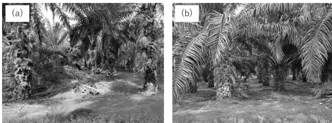
Figure 2. (a) Individually-owned and (b) Company-owned oil palm plantations in the field survey areas

Company-owned oil palm plantations account for a much greater share of land than individually-owned ones. The companies hire many workers, including local and foreign workers, to efficiently maintain and systematically manage the land (Koh & Wilcove, 2007). As shown in Figure 2 (b), the companies have workers remove fallen leaves from the ground, weed the area, and then fertilize the soil using chemical or organic fertilizers to accelerate tree growth/fruit production. Over the past few decades, company-owned oil palm plantations have used chemical fertilizers that have degraded the quality of river water, particularly when heavy rains and subsequent surface runoff occur. Accordingly, some companies have recently shifted to using organic fertilizers (Ismail, Zulkifli, & Azmi, 2010).